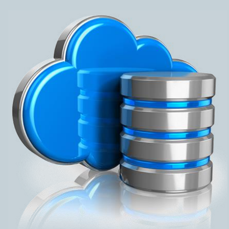
Automatics code and DB backups